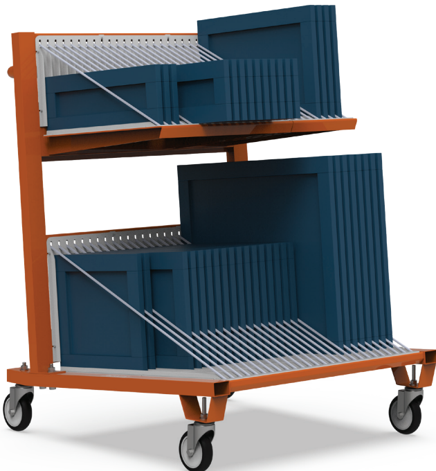
PNTPFDDM-ANG with PNTPFDDM-SHF

Pricing effective 8/7/2025. Subject to change without notice.