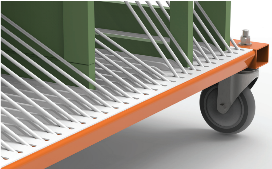
PNTPFDDM & PNTPFDDM-ANG