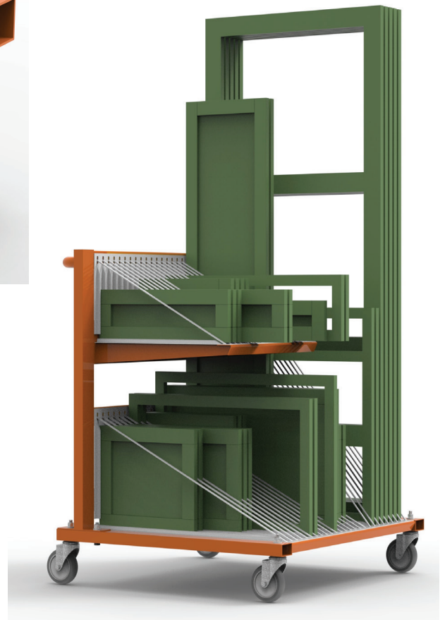
PNTPFDDM with PNTPFDDM-SHF