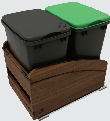
Craftsman 2-Bin Waste Pullouts

Walnut Solid Wood Construction w/Black Wire Accents & Blum Movento Soft-Close