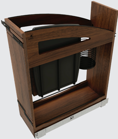
Craftsman Knife Organizer Pullouts Walnut Solid Wood Construction w/Black Wire Accents & Blum Movento Soft-Close