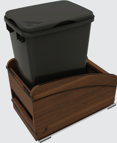
50Qt. Craftsman 1-Bin Waste Pullout Walnut Solid Wood Construction w/Black Wire Accents & Blum Movento Soft-Close