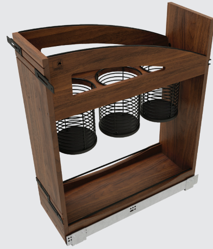
Craftsman Utensil Org. Pullouts Walnut Solid Wood Construction w/Black Wire Accents & Blum Movento Soft-Close