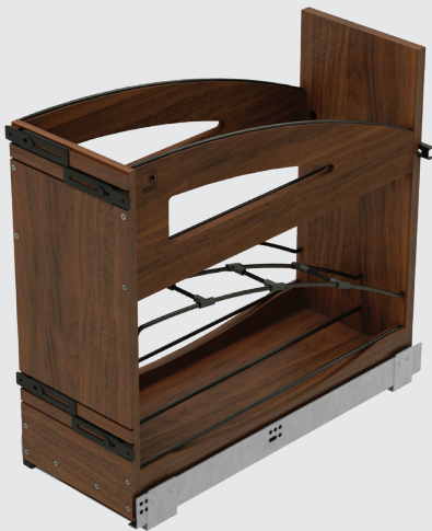
Craftsman Bakeware Org. Pullouts Walnut Solid Wood Construction w/Black Wire Accents & Blum Movento Soft-Close