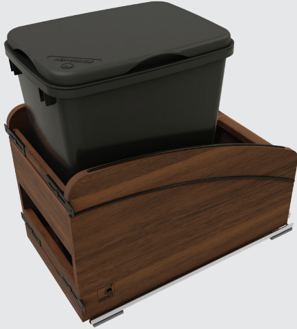
35Qt. Craftsman 1-Bin Waste Pullout Walnut Solid Wood Construction w/Black Wire Accents & Blum Movento Soft-Close