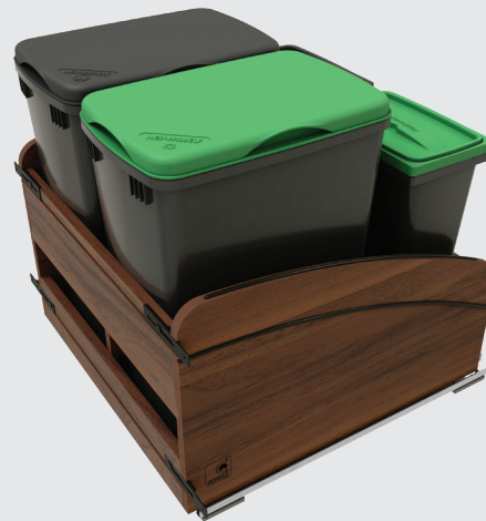
Craftsman 4-Bin Waste Pullout

Walnut Solid Wood Construction w/Black Wire Accents & Blum Movento Soft-Close