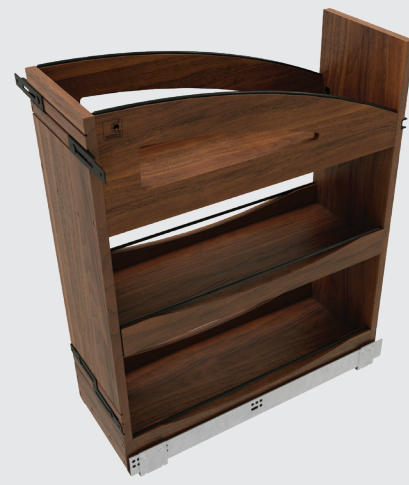
Craftsman Base Organizer Pullouts Walnut Solid Wood Construction w/Black Wire Accents & Blum Movento Soft-Close