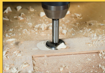
Re-drill hole in correct location, machining directly into cured WoodFil Epoxy.