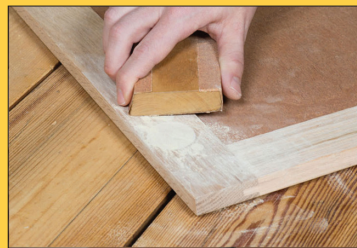
After 60 minutes sand excess cured WoodFil Epoxy from repaired area and stain if necessary.