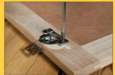
Attach pocket hinge to correct location, threading screw directly into cured WoodFil Epoxy.

Offer valid: 4/15 - 4/30/2026. Please reference promo code LP2379 when placing an order with Customer Service. For online orders, enter promo code LP2379 in the promo code field of the shopping cart.