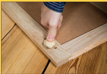
Press the just mixed WoodFil Epoxy into the hole, completely filling void.