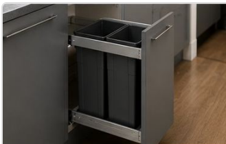
WASTE BIN PULLOUTS