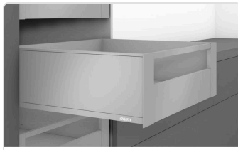
DRAWER BOX SYSTEMS

FEATURING: Blum • Rev-A-Shelf • Grass America • Hettich • Salice America • Kesseböhmer USA • Sugatsune America • Makita USA • Surteco USA • Festool