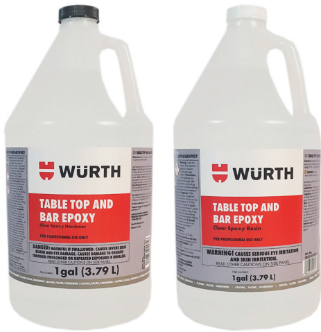
Table Top and Bar Epoxy Resin & Hardener