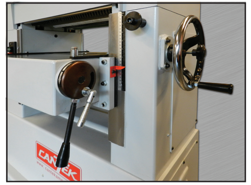
TABLE & BED ROLL ADJUSTMENT The idle bed rolls are conveniently adjusted from the front of the table. The eccentric cam allows you to raise and lower the bed rollers for optimum feeding results. A side handwheel adjusts the machine bed. The height is displayed by a ruler and indicator.

Equipped with adjustable idle bed rollers which can be raised and lowered to facilitate in feeding difficult material. The rollers are directly opposed from the top driven feed rollers. The table surface is ground and polised to provide minimal friction.