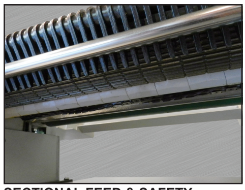
SECTIONAL FEED & SAFETY SYSTEM

Equipped with sectional kickback fingers, sectional spring loaded serrated pressure rollers, and sectional pressure shoes for the most positive and safe feeding operations. The outfeed roller is coated with urethane for a mark free planed surface.