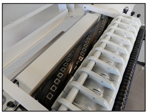
SPIRAL INSERT KNIFE CUTTERHEAD The spiral insert knife cutterhead provides a smooth finish with a quiet cutting operation. 4-sided solid carbide insert knives can be easily rotated for a new sharp cutting surface.