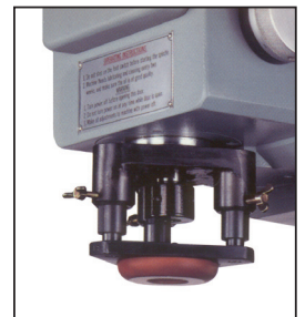
Workpiece Holding System (Optional)