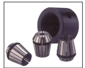
Double Taper Collets