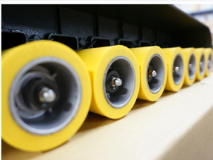
Patented 7-wheel design is ideal for feeding short material