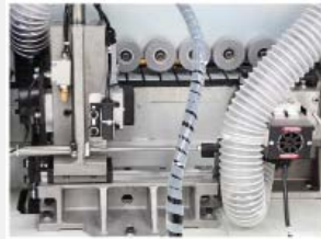
High frequency end trim for front and rear trimming of panel