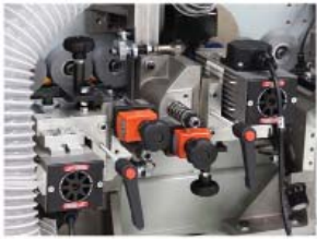
High frequency top & bottom trimmers with mechanical readouts