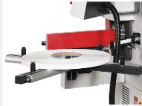
Coil edge feeding tray