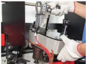
Quick change glue pot