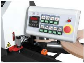
Operator control located at infeed of machine, heated infeed fence

The Cantek MX340 Automatic Edgebander is a compact edgebander capable of applying up to 3mm thick edge tape on cabinet parts and more. It comes equipped with high frequency motors on both the end trim and top & bottom trim. In addition it is equipped with PVC radius scraping and buffing units. It's compact design and affordable price point make it the ideal edge banding solution for the small cabinet shop who does not require pre-milling.