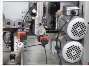
PVC scraping unit with 2mm radius knives and buffing motors