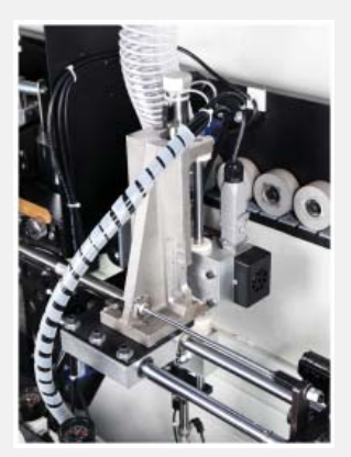
End trimming unit