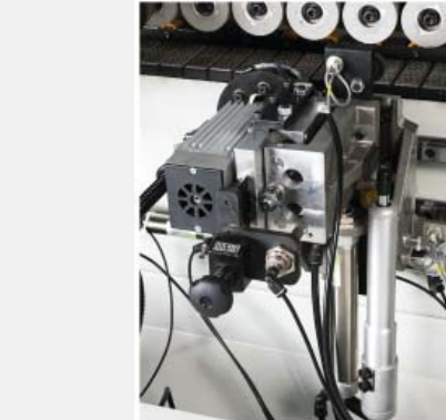
Corner rounding unit