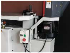
Powerful 3HP motor with oscillation gearbox