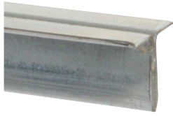
953 Upper T Guide