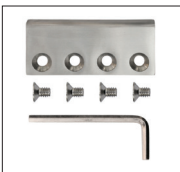
SS-FR-C Flat Rail Connector