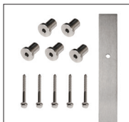
SS-FR-65-A Flat Rail with Mounting Brackets