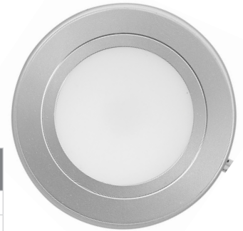
A- Nickel Finish shown B- Black