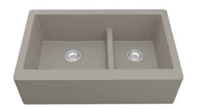
Shown in Concrete