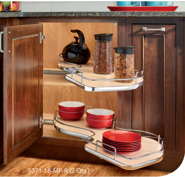
5371-18-MP-R (2 Qty.)

Utilize you existing shelf by creating a two-tier with two single-tier units.