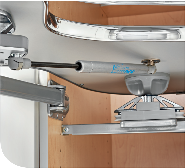
Soft-Close Kit sold separately

Available in three sizes, single and two-tier, the Cloud fits into nearly all blind corner applications, and its chrome rails and gray or maple shelving make it an attractive addition to any kitchen. So ease your knees, back and stress levels and elevate your kitchen storage to the cloud.