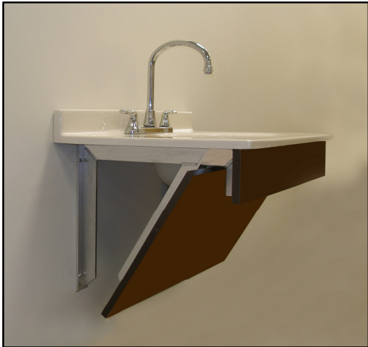
Typical-Stocked Vanity Enclosure