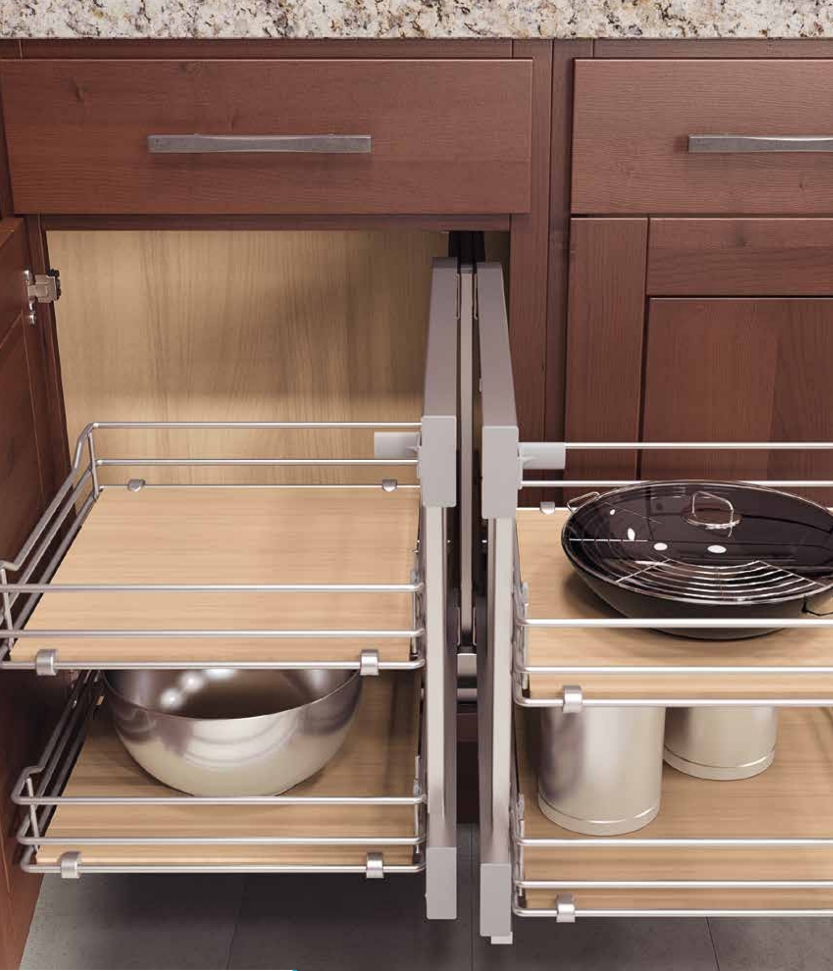
VS COR Flex | Scalea maple silver